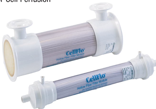
Spectrum CellFlo® Modules with process volumes of 3 to 1,000 liters.

Spectrum supplies engineered systems for monitoring the operating conditions in long-term cell culture. Spectrum also gladly assists users in adapting existing hardware to utilize CellFlo® technology. Request the Spectrum Perfusion Handbook shown below.